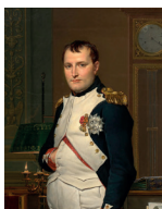
19th century Napoléon Bonaparte