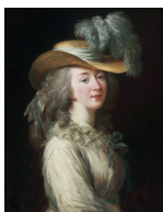
Marie-Jeanne Bécu Madame du Barry Marie-Louise O'Murphy Mistress of King Louis XV