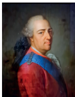
Louis XV King of France