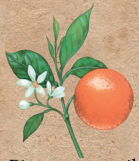
Bitter orange oil