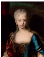
18th century Maria Theresia Archduchess of Austria and Queen of Hungary and Bohemia