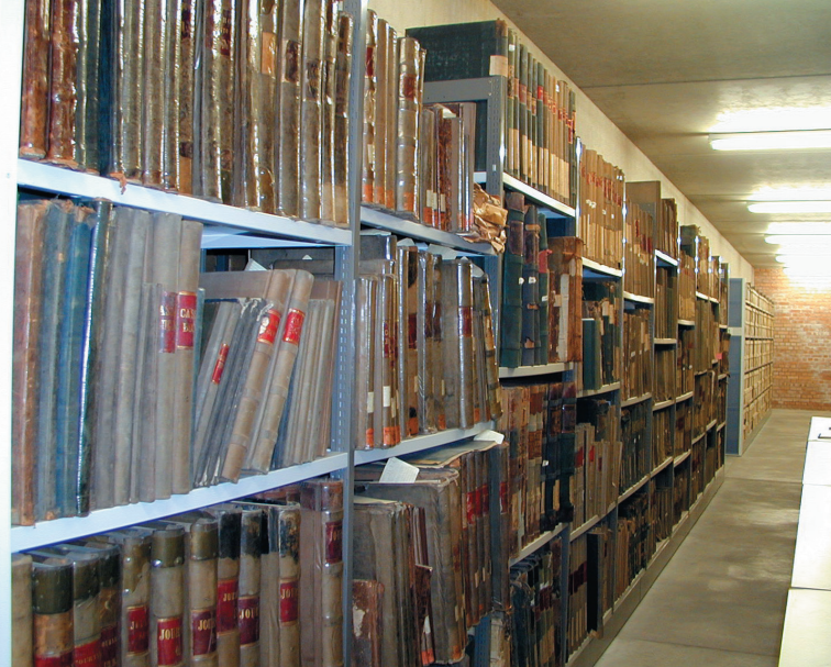
RWWA – Business Archive of Rhineland-Westphalia.

The history of the Farina company is documented in the archives of Rhineland-Westphalia (RWWA, 1709-2000) and Paris (1251-1709). There are fascinating criminal stories of imitators and counterfeiters and amusing attempts at deception from the time when brands had no legal protection.