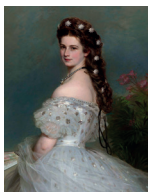
Empress Elisabeth (Sisi)