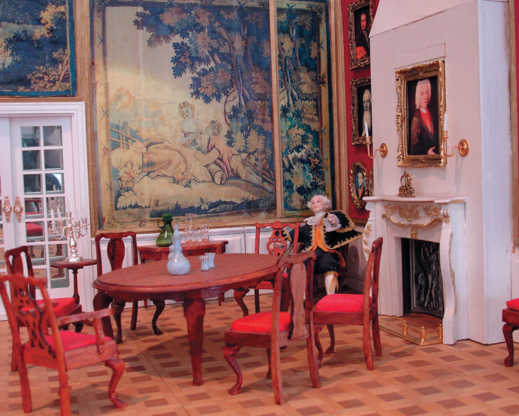
Farina House model from the rococo period

There is a desk in the office of Johann Maria Farina which was imported from Portugal in 1723. The showcases display the history of the flacons designed by painters such as Wassily Kandinsky and Franz Marc. Here, at a site built on Roman cellars, experience 2000 years of Cologne history.