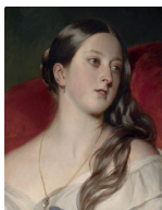
Pauline Bonaparte Princess Borghese