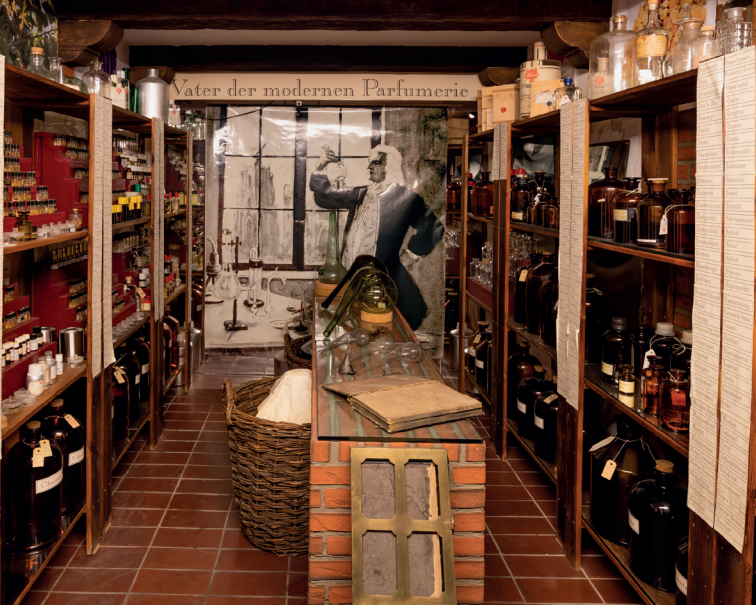
The room of precious essences.

The essence room: hundreds of fragrance oils in small phials. Here you learn why the Eau de Cologne is the beginning of modern perfumery. How are essences made? The secrets of extraction, enfleurage and distillation are revealed.