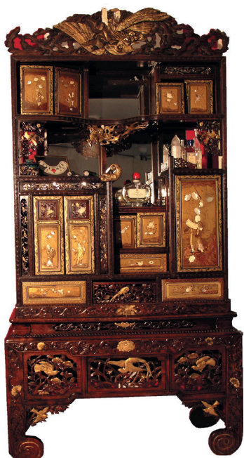
Asian sale cabinet with inlays of ivory, gold and mother-of-pearl.

At the beginning of the guided tour, you can expect selected flacons, the history of the house and its furnishings, portraits and the family tree of the Farinas , porcelain and silver goblets. See how the world making a purchase became an art form in the 18th-century.